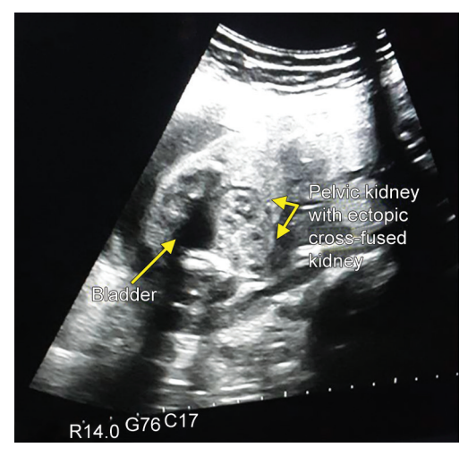
Fig. 1: Antenatal scan view of pelvic kidney with cross-fused ectopic kidney

Corresponding Author: Shraddha Singhania, Consultant Department of Radiodiagnosis, Jawaharlal Nehru Medical College, Wardha, Maharashtra, India, e-mail: drshraddha singhania@hotmail.com