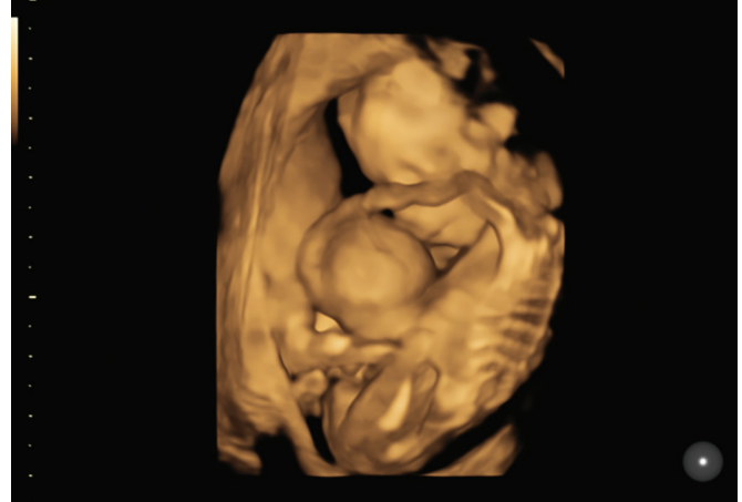
Fig. 4: Whole fetus (3D) with large omphalocele

Lately, Allyse and Wick,<sup>8</sup> at the JAMA clinical update, have stated that cfDNA screening can detect chromosome aneuploidy in pregnancy after 10 weeks' gestation but is less effective at screening for other genetic abnormalities. They also added that cfDNA tests are more expensive than other approaches.