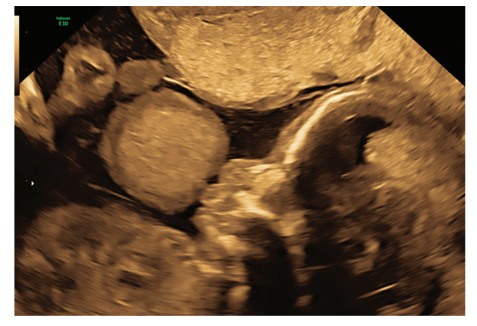
Fig. 1: The fetus "watches" large omphalocele in front of its face (2D)