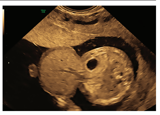
Fig. 2: Large omphalocele containing liver (2D)

This technique has its obvious advantages—the ability to get quite accurate results of the fetal DNA, especially regarding trisomy 21 and so early in pregnancy. Nevertheless, current guidelines from the American College of Medical Genetics, the American College of Obstetricians and Gynecologists, and the Society for Maternal Fetal Medicine advise that cfDNA may be offered to all women to screen for common aneuploidies and fetal sex, but it is not considered the standard approach in pregnancies that are not considered high risk.<sup>7</sup>