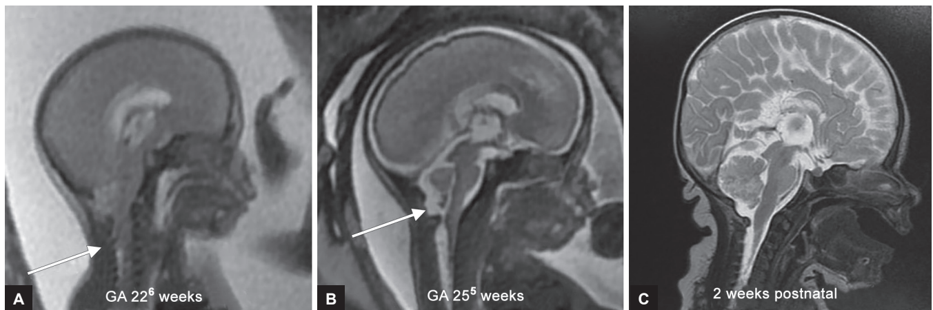
Figs 2A to C: (A) Preoperative fetal MRI: Hindbrain herniation (cerebellar herniation down to C3) and small "crowded" posterior fossa (arrow). (B) Three weeks after fetal spina bifida repair: Hindbrain herniation has already resolved, cerebrospinal fluid is detectable in the posterior fossa (arrow). (C) Postnatal MRI: No herniation of cerebellum or brain stem. Basal cistern with normal width

the non-neurulation. With the advent of fetal surgery at the end of the last century, attention was directed to the prenatal history of congenital malformation. It became clear that in some malformations, the evolution during gestation could be affected by negative processes that would eventually become clinically relevant at birth. Following that spirit, the prenatal natural history of spina