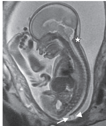
Fig. 3: A fetus with a meningocele (closed dysraphism) and, therefore, not eligible for fetal spina bifida repair. There is no hindbrain herniation (asterisk). The lesion (arrowhead) could be misinterpreted as myelomeningocele. The thin skin coverage is not always clearly distinguishable. The thickened filum terminale (arrow) could be misjudged as protrusion of a placode

Details on detection of spina bifida by ultrasound is a topic of its own and beyond this review article. However, ultrasound is not only crucial to diagnose the presence of a spina bifida, it also should provide information on the kind of spinal dysraphism (open or closed), on the functional level of the lower extremity, and on whether additional anomalies concerning the fetus or the placenta/uterus might be present that would preclude fetal repair. The sonographic appearance of the lesion itself may not always allow a distinction of the type of spinal dysraphism; however, presence or absence of hindbrain herniation can be used as an indirect indicator. In fact, in closed spinal dysraphism, such as meningocele, lipomyelocele, and myelocystocele, the Chiari II malformation is not typically present. Although presence or absence of Chiari II can be assessed with ultrasound, fetal magnetic resonance imaging (MRI) allows to best visualize it and is thus an absolutely necessary tool in the workup for prenatal OSB repair. 50,51 Figure 3 depicts a case with a closed dysraphism (meningocele) and absence of Chiari II.