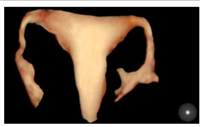
Fig. 3: Three-dimensional reconstruction of the uterine cavity and tubes after 3D-CCI-HyCoSy

Two cases of severe post-procedure pain were reported in women who underwent conventional HyCoSy. Any patient from the group who underwent 3D-CCI HyCoSy referred post-procedure pain.