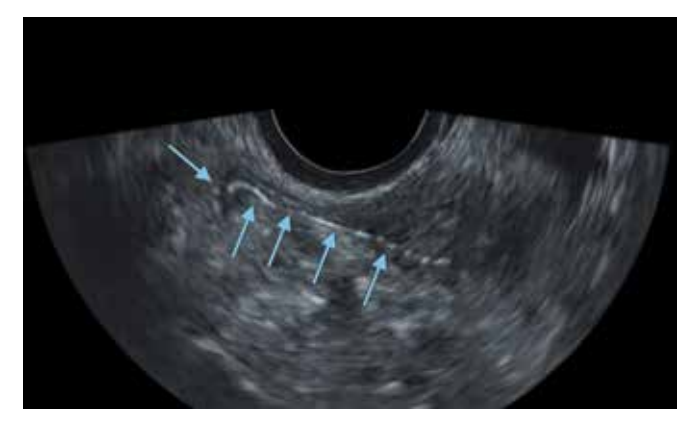
Fig. 2: Hysterosalpingo-contrast-sonography using CCI. The complete tube is seen. Contrast passage depicted as a white line (arrows)

Assessment of Tubal Patency with Tridimensional Coded Contrast Imaging Hysterosalpingo-Contrast-Sonography