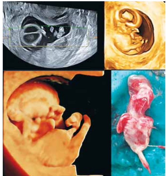
Fig. 2: Above 2D (left) and 3D US (right) showing clearly the siren or mermaid cauda which is especially clear using HDLive

Although several hypotheses have been postulated as the origin of the malformation, the exact etiology of the syndrome remains unknown. A damage occurring early during embryonic development in the caudal mesoderm was initially proposed by some authors 28 as to the cause of the limb malformation. This event may result in merging, malrotation and dysgenesis of the lower extremities. Gardner and Breuer (1980) 29 postulated that the overdistention of the caudal portion of the neural tube may cause a lateral rotation of mesoderm and the fusion of the early inferior limbs. Later experiments in rodents exposed to high doses of retinoic acid confirmed that an early interference in the process of gastrulation was correlated to the caudal dysgenesis syndrome and congenital lower limb malformations. 30 The 'vascular steal' phenomenon due to aberrant vasculature, which impairs blood flow to the lower part of the body, resulting in abnormal development was also hypothesized as to the origin of the syndrome. A common feature in the mermaid syndrome is the presence of a single large umbilical artery. Arteries below the level of this steal vessel are underdeveloped and tissues dependent upon