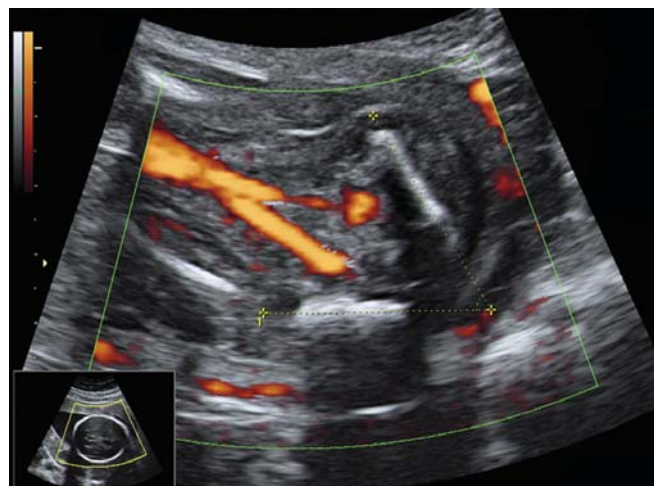
Fig. 5: Transverse section of the fetal pelvis (20 weeks of gestation): iliac wing angle, umbilical arteries