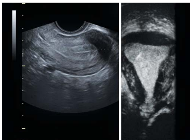
Fig. 2: A coronal view of the uterus