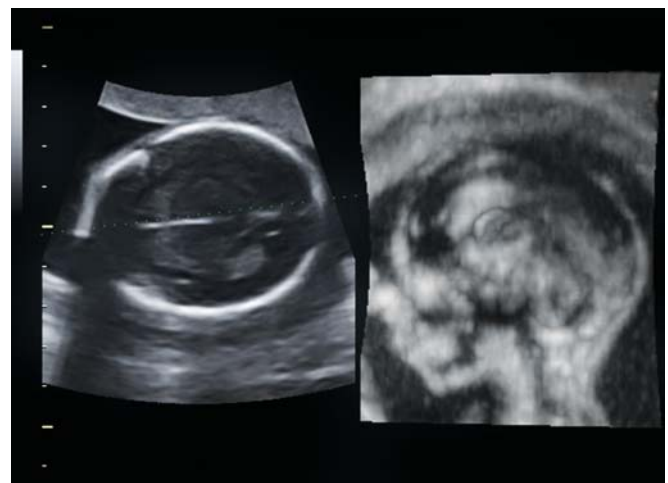
Fig. 1: Volume contrast imaging (VCI) in the C-plane: in the axial scan a line is selected passing through the cavum septi pellucidi between the two hemispheres. The sagittal view (C-plane) orthogonal the axial one is simultaneously displaced showing the corpus callosum (19 weeks of gestation)

In Hungary, traditionally nearly 100% of the physicians who perform obstetric and gynecologic ultrasound scans are obstetricians and gynecologists, who are very knowledgeable in fetal anatomy and physiology as well as in anatomy and physiology of the internal female genital organs. 3-5 Hungary was one of the first countries to introduce the routine screening of the pregnant population. 6 It is worth carrying out routine screening in each pregnancy because the majority of abnormalities occur in pregnancies with low risk. Screened cases and the examination of high risk groups have to be referred to higher level centers. Here, appropriate technical background and qualified personnel are present