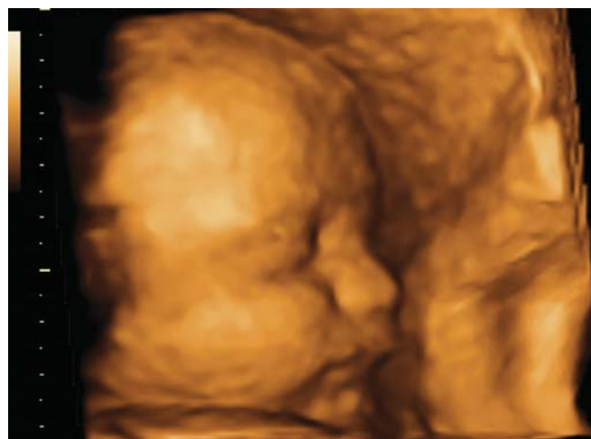
Fig. 3: 3D image of fetal face (28 weeks of gestation)