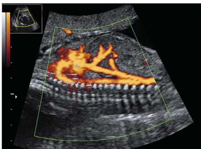
Fig. 6: Sagittal view of the fetal thorax: aortic arch, inferior cava vein (22 weeks of gestation)