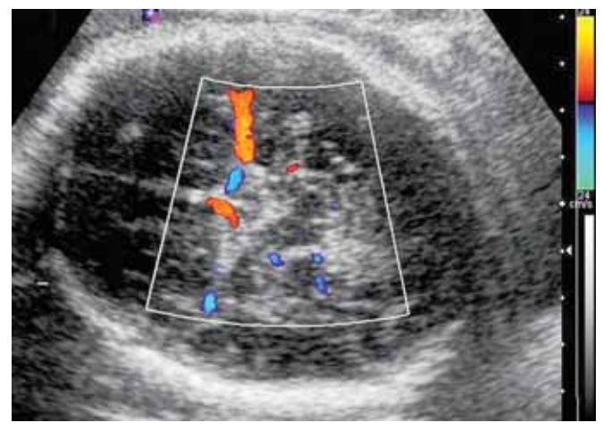
Fig. 1: The proper transverse section of fetal head is presented and MCA is identified with Doppler mode