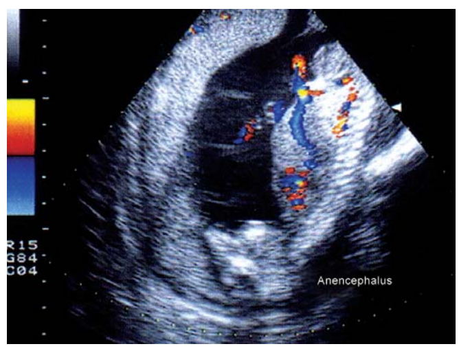
Fig. 2B: Transvaginal color Doppler scan of anencephalic fetus at 11 weeks of gestation. Color signals are obtained from fetal heart, aorta and umbilical artery