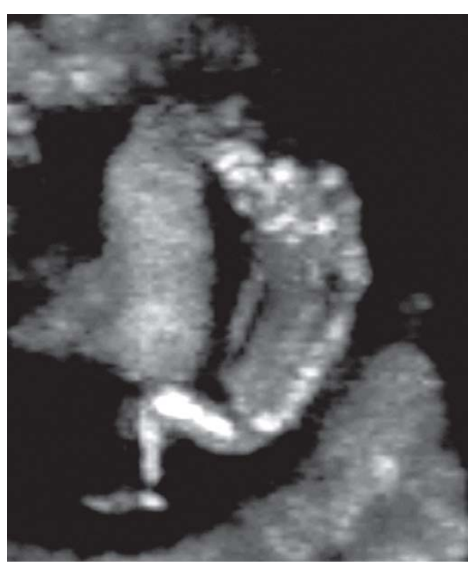
Fig. 2A: Three-dimensional ultrasound of anencephaly at 11 weeks of gestation