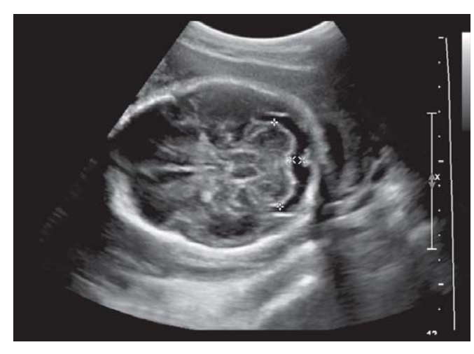
Fig. 3C: Standardized cranial level for measurement of cerebellum and cisterna magna. Note the symmetry of the calvarial bones and cerebellar hemispheres. This axial plane of section is at the level of the inferior portion of the third ventricle, slightly inclined in relation to canthomeatal line

routine fetal ultrasonography and the lack of evidence for improvement in perinatal mortality based on routine ultrasound in late pregnancy, third trimester examinations are essentially a tool for the evaluation and management of special circumstances.<sup>16</sup>