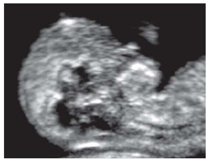
Fig. 1A: Transvaginal ultrasound of fetal brain at 12 weeks gestation