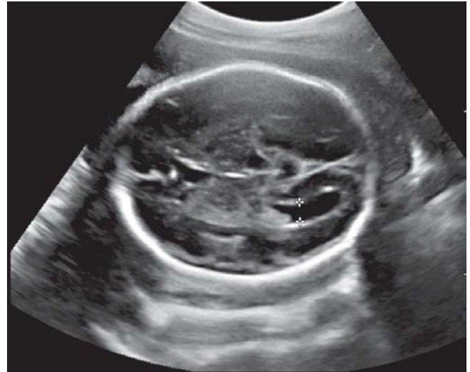
Fig. 3B: Ultrasound assessment of the atrial width. The calipers are positioned inside the echoes of the walls of the ventricles, and are oriented perpendicular to the cavity

Medical students should understand that fetal ultrasonography in the third trimester is usually based on specific indications related to findings from the second trimester examination or other special risks. Some central nervous system anomalies may not be detected until the third trimester; however, given the general limitations of