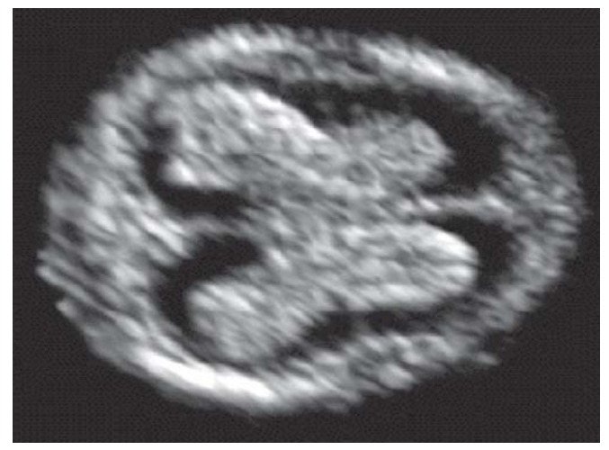
Fig. 1C: Transvaginal scan of choroid plexuses filling more than onethird of the lateral ventricles (normal finding at this gestational age)